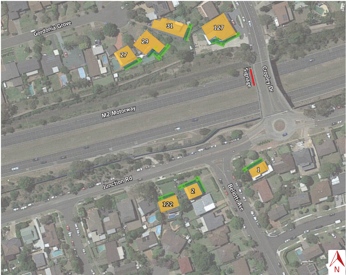
Environmental Zone Legend: